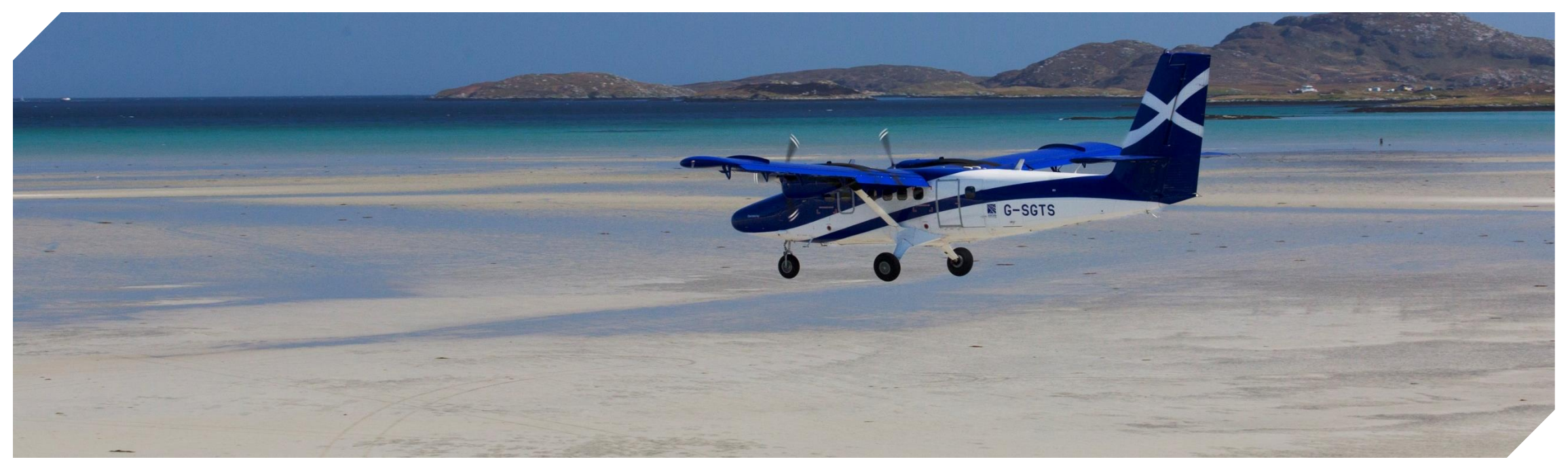
Twin Otter Landing on the beach at Traigh Mhor.